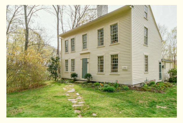
His family lives in a 250-year-old farmhouse (not pictured) that is in constant need of repair and upkeep. He loves the house, but acknowledges it uses up a ton of their spare cash.

He runs an agrotourism business that surged in popularity during the pandemic when people wanted COVID-safe outdoor activities. Their piglet petting experience has gotten lots of press and brings in an influx of cash each summer. One of his big, long-term goals is to expand his business and hire a couple of additional employees.