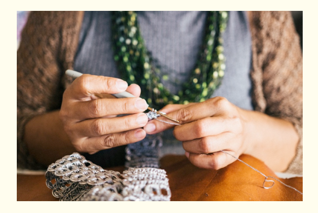
Now that her oldest is a teenager, she has more time for her own hobbies, like crochet.

"I feel like it's harder to trust people because it's everybody for themselves."